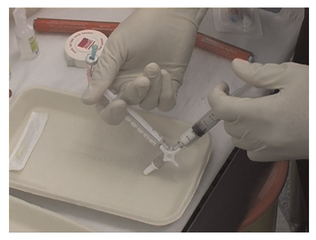
Figure 1 Tessari method for creating sclerosant foam. Gas and sclerosant are oscillated between two syringes via a three-way tap approximately 20 times

The most widely used method is that of Tessari, which is readily achieved using materials available in most clinics (Figure 1). Two syringes are connected using a three-way tap. A 5 \mu m intravenous filter can be inserted between the syringes and this greatly improves the quality of the foam. Either 2 mL or 5 mL syringes may be used, or a combination. A mixture of sclerosant and air is drawn into one syringe at a ratio of one part