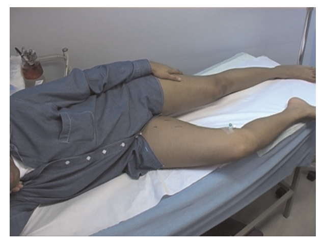
Figure 3 The patient lies in the right lateral position to permit cannulation of the right great saphenous vein

guidance and can be treated by direct needle injection without prejudicing safety or efficacy.