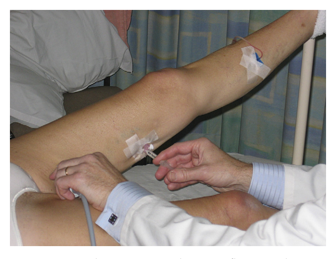
Fig. 2. Foam sclerosant injected via Venflon into the GSV under ultrasound control.

The vast majority (62 of 69, 90%) advised patients to wear compression stockings after the first few days of compression bandaging. These were usually Class II compression stockings (39 of 61, 64%) or